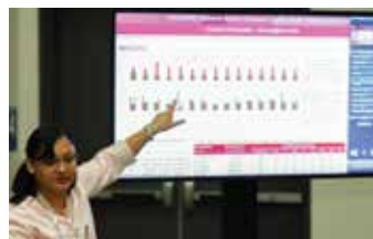
Scientific and Applied Learning and ePoster/Poster Sessions