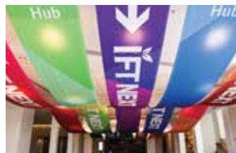
IFTNEXT and On Trend Exhibition