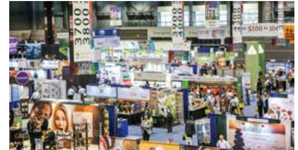
Exhibit with Purpose

Meet and learn from the people who are driving innovation across the science of food spectrum.