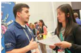
Career Center Live