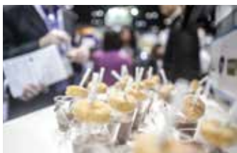
IFT Food Expo