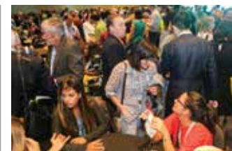
Member Meetings and Networking Receptions